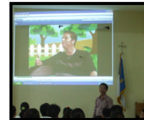
Teaching equipment donated by CRI in Vietnam